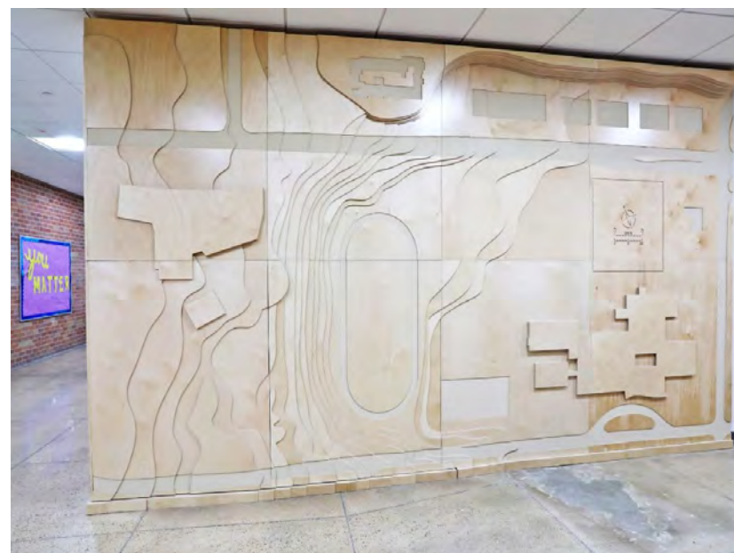
Here's a sneak peek inside the administrative area and neighboring topography wall.