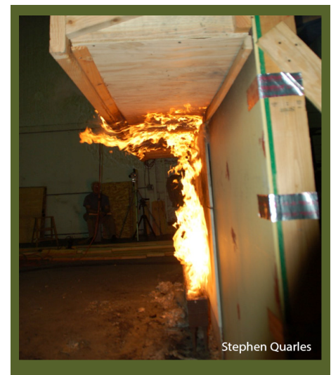
Lateral flame spread was reduced when a combustible soffit material ignited in this test of a soffited-eave with a combustible soffit material.