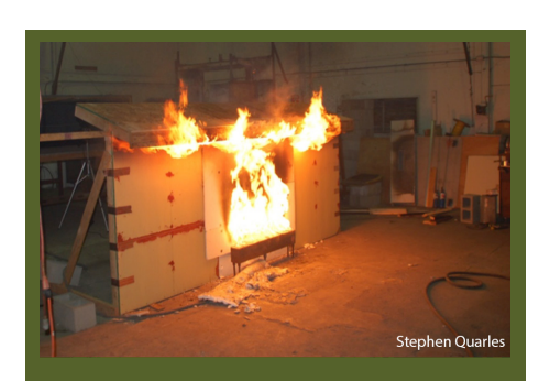
Flame impingement exposure to the underside of the eave, and time-to-ignition of the joists, blocking and fascia was quicker; and lateral flame spread faster, when an open-eave design was used in research experiments.