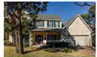
6804 Marbrys Ridge Cove