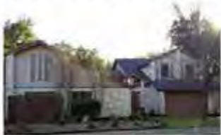
5103 Backtrail Drive