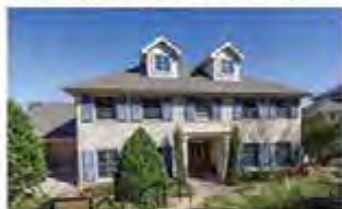
7825 West Rim Drive