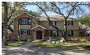
7704 Stonewood Drive