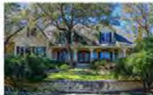
6310 Ledge Mountain Drive