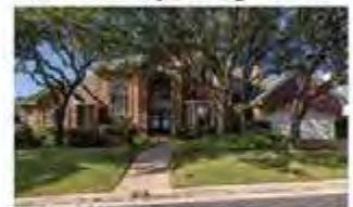
7218 Valburn Drive