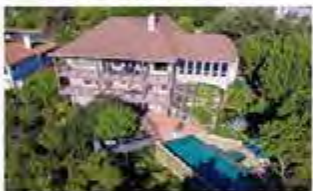
7215 Valburn Drive