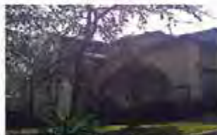
5701 Westslope Drive #21