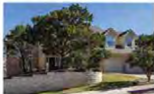
6221 Edwards Mountain Cove