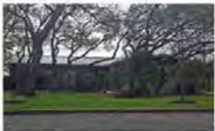
3923 Sierra Drive