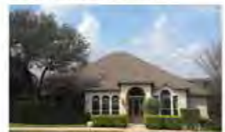
6432 Williams Ridge Way