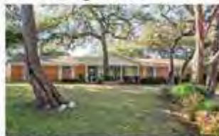
7204 Sungate Drive