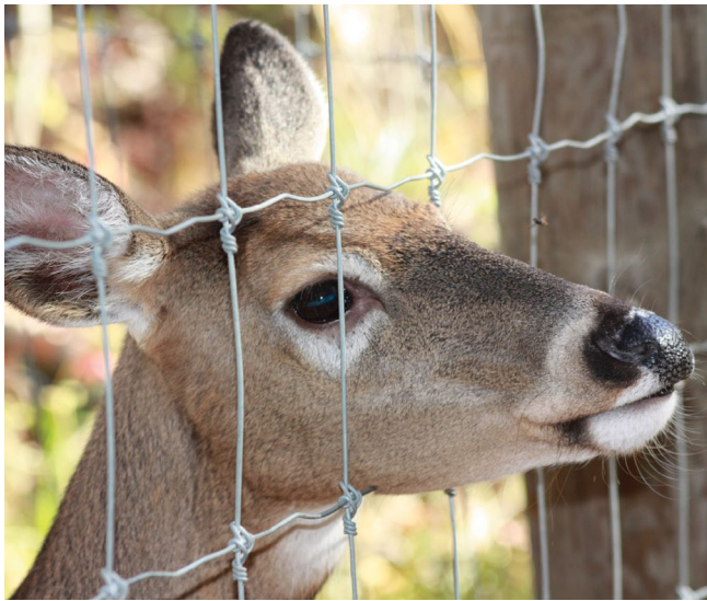
High fencing can be a long-term solution to human-deer conflicts

conducted at the community level. Hunting zones within the community are identified to maximize human safety and promote ethical, humane, and efficient deer harvest. Deer are often baited into the area for a period of time and then hunters are placed at those locations. Meat from carcasses must be used by the hunter or donated to a designated charitable organization. Both hunters and non-hunting residents must recognize that urban deer hunting is a management tool designed to reduce the number of deer, with considerable emphasis on removing females. This is not a trophy buck hunt. Hunting in Texas can be done using traditional hunting license tags or through hunting permit programs offered by TPWD that allow individuals to harvest more than regular bag limits ( Managed Lands Deer Permits or Landowner Assisted Management Permitting System ).