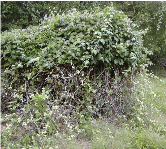
The negative impact of deer can be seen by browse lines and by the presence of plants that show hedging.

The impact of deer on a plant community has a cascading effect on deer and other animal populations. Invertebrates, reptiles, amphibians, birds, small and large mammals rely on diverse plant communities for food and cover, especially within those zones easily reached by foraging deer. Recovery of habitat affected by deer is impacted not just by short-term deer numbers, but also by the history and severity of over-browsing, soil conditions, and climate. Some studies indicate that drastic reductions in deer numbers have little effect on increasing plant diversity over the short-term and vegetation recovery may only occur through extended periods of low deer densities.