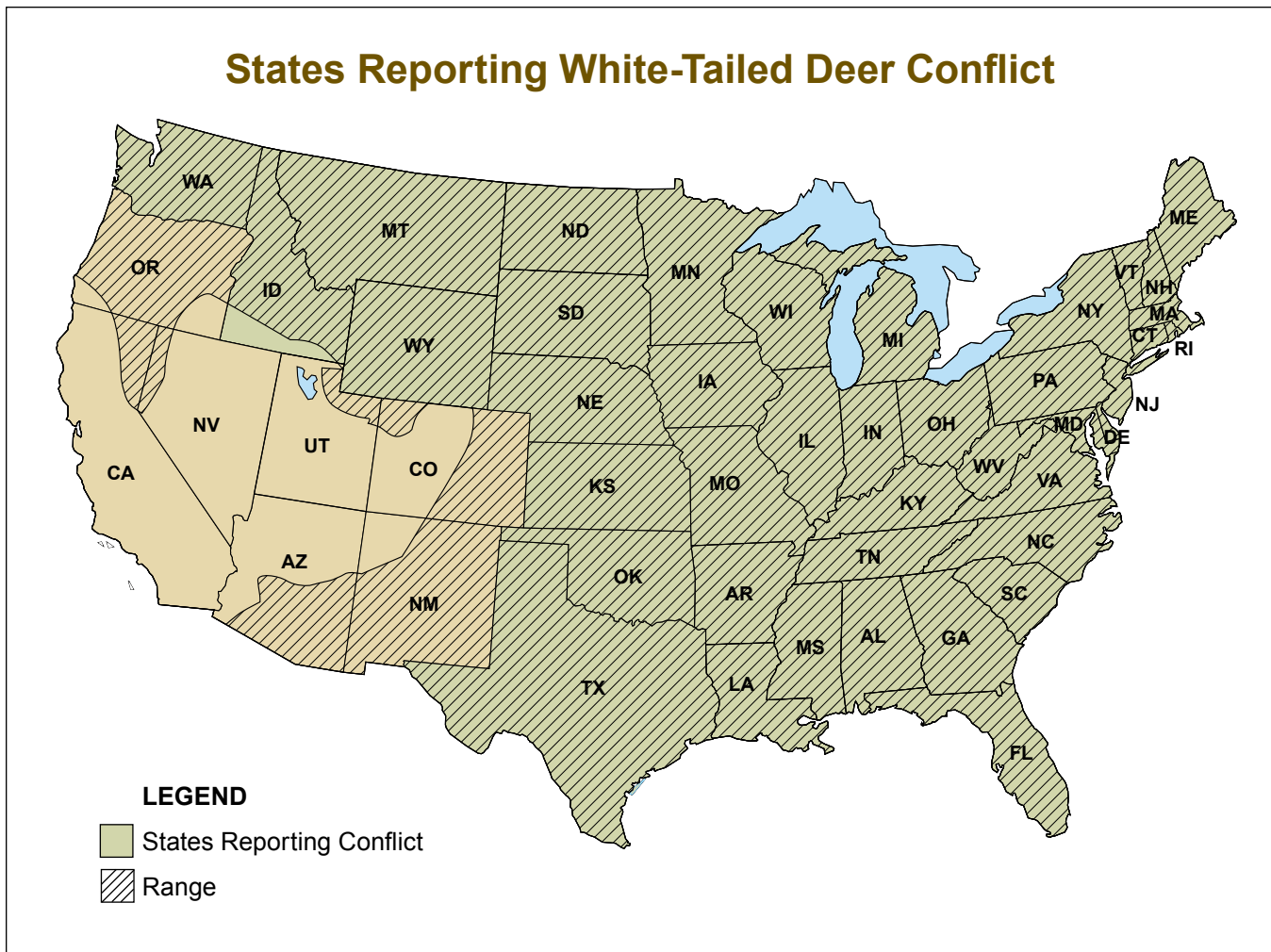
Figure 1. Zoogeographic range of white-tailed deer and states reporting white-tailed deer conflicts.

publication is to educate readers on the biology and ecology of urban white-tailed deer and to provide fundamental considerations required to develop an effective management plan.