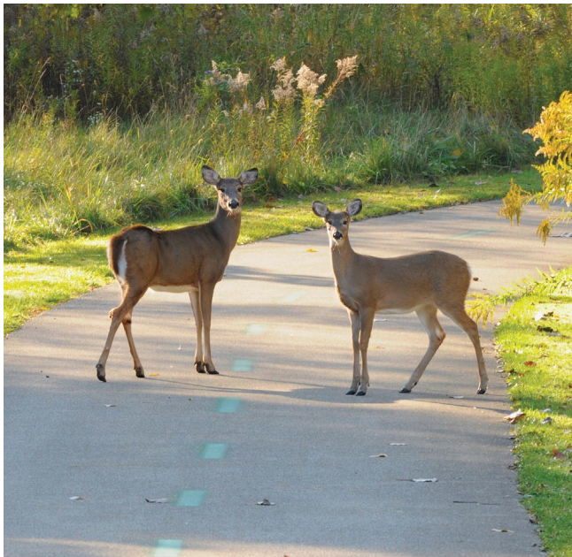
Many urban communities are experiencing overabundant deer populations, urban sprawl, and limited natural resources.

People attach dramatically different emotions and value systems to white-tailed deer. Some people view deer as an innocent, natural part of an unnatural setting that does not require intervention by people. Others view deer as ravenous ecological forces that must be removed from the landscape. Both opinions are to be respected, yet each is imperfect.