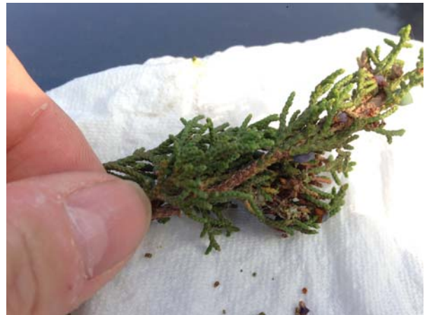
Juniper budworm infested branch tip.

If a pesticide treatment is desired, look for active ingredients such as Bacillus thuringiensis var. kurstaki , azadirachtin (neem) or spinosad. Products will work best on smaller caterpillars. When using pesticides, read and follow all label instructions.